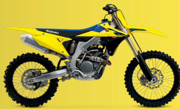
Champion Yellow No. 2