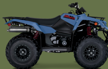
Armored Blue Gray

Whether you are working hard or getting away from it all, the 2026 Suzuki KingQuad 400ASi SE helps you every step of the way. The fully automatic Quadmatic™ transmission has 2WD and 4WD modes to handle rough trail conditions while completing even the most demanding chores. Along with exceptional engine performance across the powerband, its high-performance iridium spark plug, and Pulsed-secondary AIR-injection (PAIR) system help provide outstanding fuel efficiency and impressive performance.