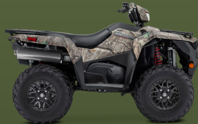
True Timber Kanati

The KingQuad 500AXi Power Steering SE Camo is not just an ATV, it's a KingQuad ATV. Suzuki, the inventor of the 4-wheel ATV, has created the world's best sports-utility quad with bold styling plus more capability and reliability than ever before. The legacy of the iconic KingQuad remains fresh and exciting and is ready for riders to join its history. Ready for outdoor adventure, the 2025 KingQuad 500AXi Power Steering SE Camo helps tackle challenging terrain with the capabilities that only a KingQuad possesses.